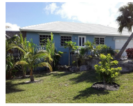
100 Bermuda Close - Cottage