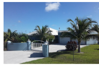
10 Bermuda Close - Main House