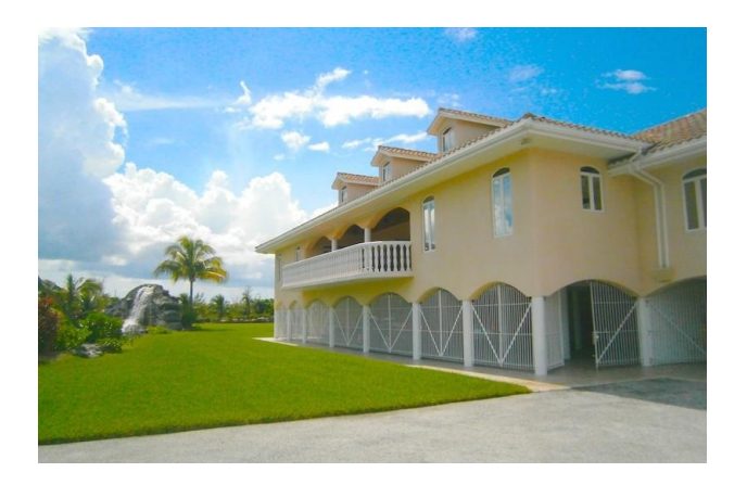
Price: $1,600,000 Address: 41 DUNTON LANE,Freeport City: Grand Bahama/Freeport MLS#: 50434 Lot Size: 84,402 sq. ft. Listing No: R427 Beds: 5 Baths: 6 Living Area: 8,208 sq. ft. Year Built: n/a Status: For Saleonly