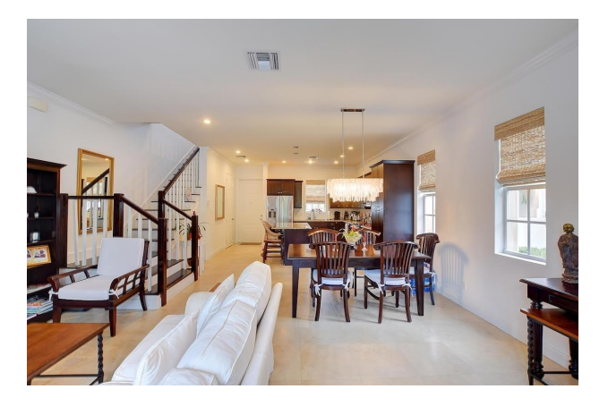
Price: $625,000 Address: BALMORAL,Prospect Ridge City: New Providence/Paradise Island MLS#: 56615 Lot Size: 1,400 sq. ft. Listing No: R445 Beds: 2 Baths: 3 Living Area: 1,400 sq. ft. Year Built: 2012 Status: For Saleonly