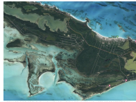
WESTERN SIDE OF THE SUBDIVISION WITH A VIEW OF THE CREEK