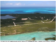
CLOSE UP OF SUBDIVISION WITH VIEW OF CARIBBEAN SEA, CREEK & ATLANTIC OCEAN

Price: $47,500 Address: LAKEFRONT AVE, Little Exuma City: Exuma & Exuma Cays MLS#: 52430 Lot Size: 20,000 sq. ft. Listing No: R30 Beds: 0 Baths: 0 Living Area: 20,000 sq. ft. Year Built: n/a Status: For Saleonly