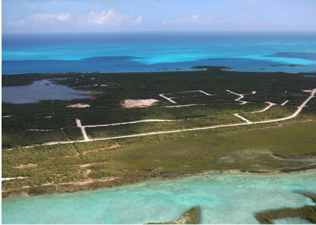
CLOSE UP OF SUBDIVISION WITH VIEW OF CARIBBEAN SEA, CREEK & ATLANTIC OCEAN

Price: $47,500 Address: ALBA DRIVE, Little Exuma City: Exuma & Exuma Cays MLS#: 52432 Lot Size: 20,000 sq. ft. Listing No: R31 Beds: 0 Baths: 0 Living Area: 20,000 sq. ft. Year Built: n/a Status: For Sale only