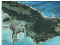
WESTERN SIDE OF THE SUBDIVISION SHOWING NATURAL BEAUTY AND LOTS OF PROTECTION