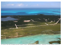
CLOSE UP OF SUBDIVISION WITH VIEW OF CARIBBEAN SEA, CREEK & ATLANTIC OCEAN

Price: $47,500 Address: ALBA DRIVE, Little Exuma City: Exuma & Exuma Cays MLS#: 52432 Lot Size: 20,000 sq. ft. Listing No: R31 Beds: 0 Baths: 0 Living Area: 20,000 sq. ft. Year Built: n/a Status: For Sale only