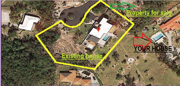
Subject Property & Vicinity